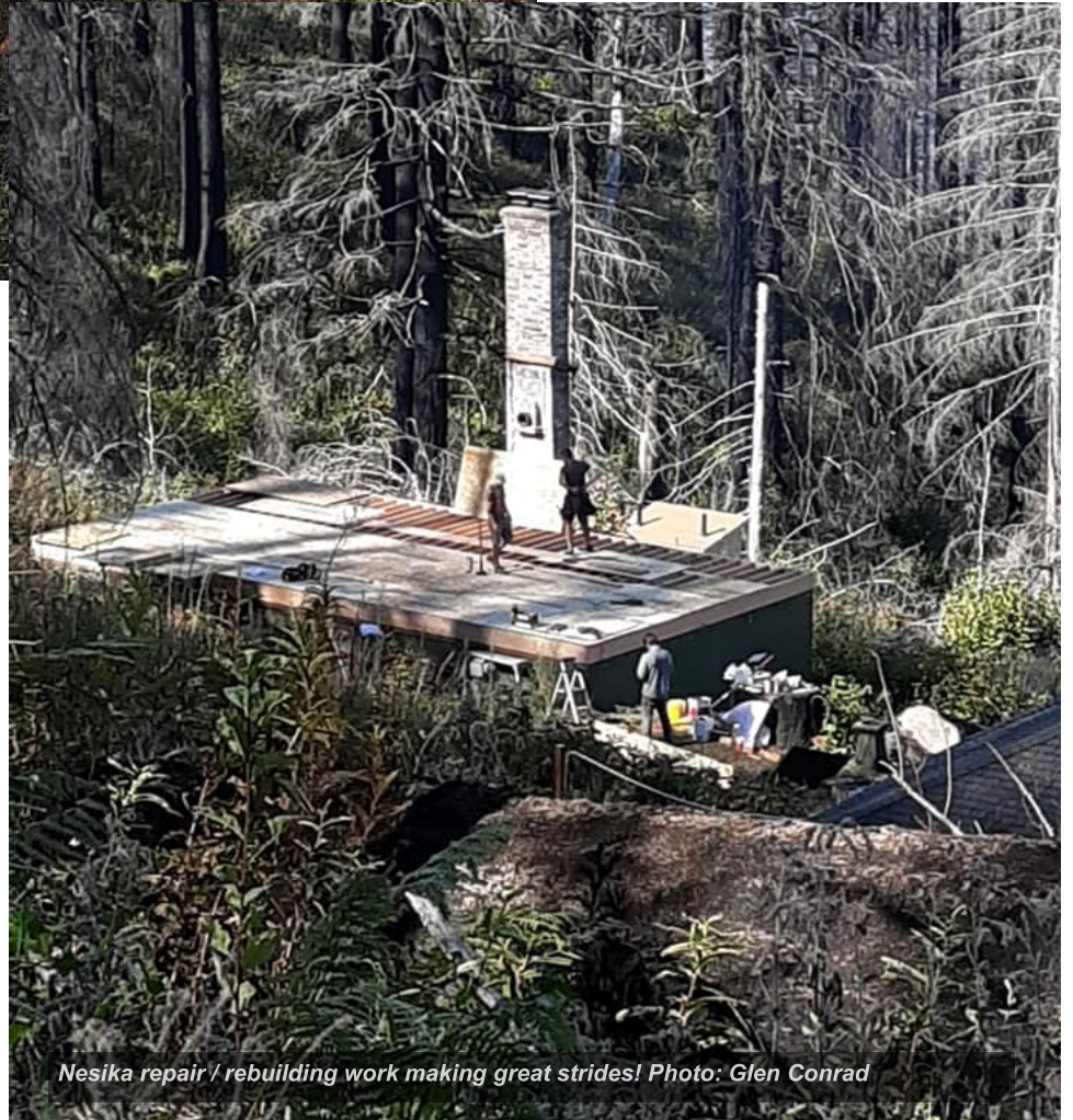
Nesika repair / rebuilding work making great strides!