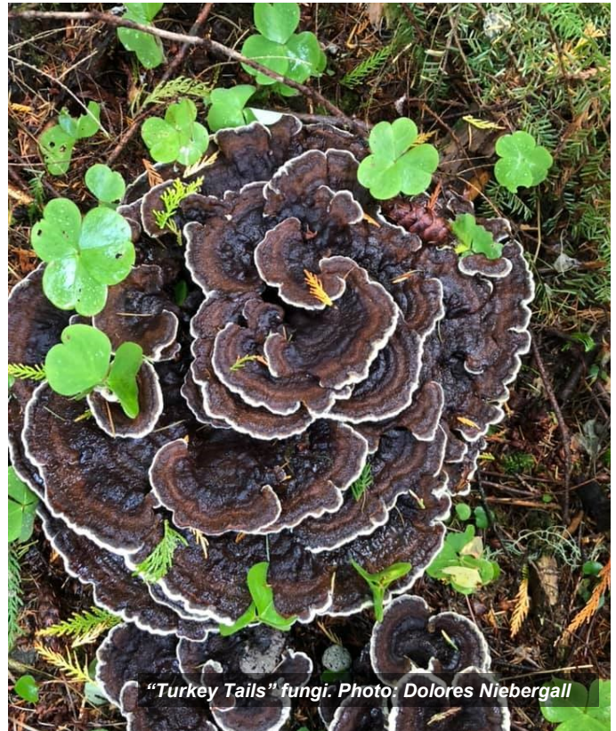
"Turkey Tails" fungi.