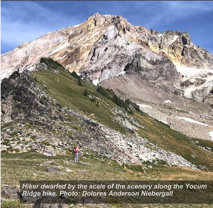
Hiker dwarfed by the scale of the scenery along the Yocum Ridge hike.