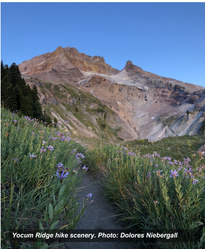
Yocum Ridge hike scenery.