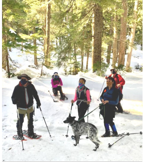
Glacier View Snowshoe.

Let's explore some of the Badger Creek Wilderness. Here are the details of the trail we will be taking: https://www.oregonhikers.org/field_guide/Gumjuwac-Badger_Lake_Loop_Hike . This is a Trails Club of Oregon event which is free to members and $2 for non-members. We will be moving at about two miles per hour average regardless of elevation. This is a fairly difficult hike for most people. We will stop for lunch at Badger Lake for about 30 minutes. Other than that, we will stop several times for water but not more than 5 minutes at a time. I expect the snow and ice will be gone by this time. Waterproof boots are a must since I am not sure how muddy this trail will be. We will hike regardless of weather so please make sure you check the forecast ahead of time and come prepared for the weather.