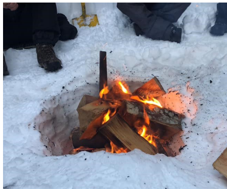
Tyee Full Moon Snowshoe.