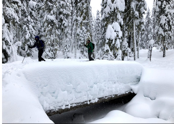
Pocket Creek Snowshoe.

Note About Dues: The Online Member Directory now includes the status of dues payments for 2021. If the dues column is blank for you, you haven't paid your 2021 dues. Thank you!