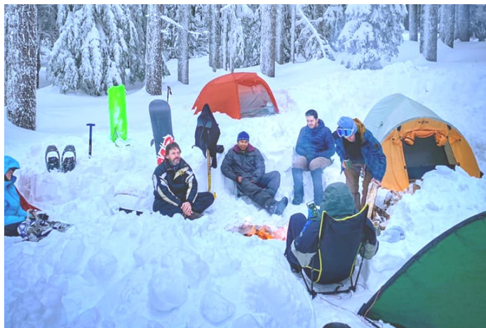
Tyee Lodge Snow Camping.