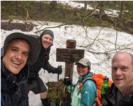
Franklin Ridge Hike.