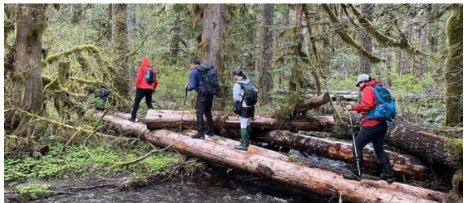
Cast Creek Wildflower Hike.