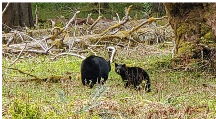
Quinault River Backpack.

We are a group of 10, and we have spots for two more people backpacking to Royal Basin Lake in Olympic National Park. Friday we will drive to the trailhead and camp. Day two we'll hike eight miles and about 2000 feet of elevation to the lake and camp, and day three return to the cars and drive home. Contact: sign up on Meetup