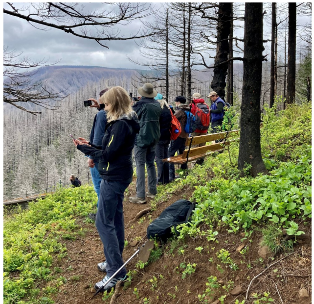
Nesika Membership Hike.