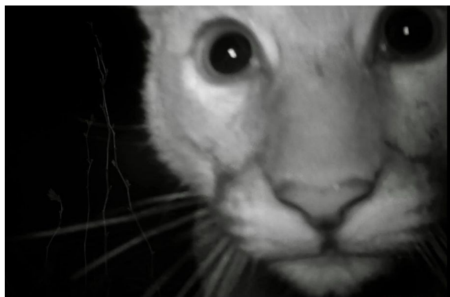
Curious Cub near Nesika.