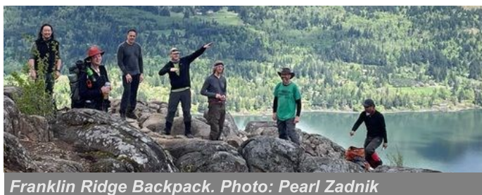
Franklin Ridge Backpack.

We will ride the entire length of Burnt Bridge Creek Trail, turn up Lakeshore, turn right at Salmon Creek Trail. Short break at Kline Pond then up 99 for about 1/2 mile, stairstepping our way through Vancouver we end up back at the start. 23.6 miles; 12-14 mph; Terrain: Moderate; Elevation: 786 ft Meet: Corner of NE 92nd and NE 19th Cir, Vancouver. Contact: sign up on Meetup