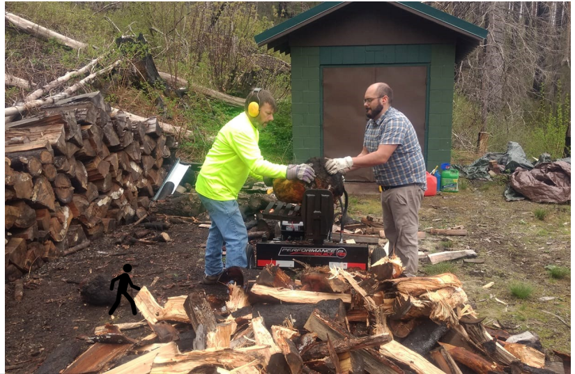
Nesika Work Day.