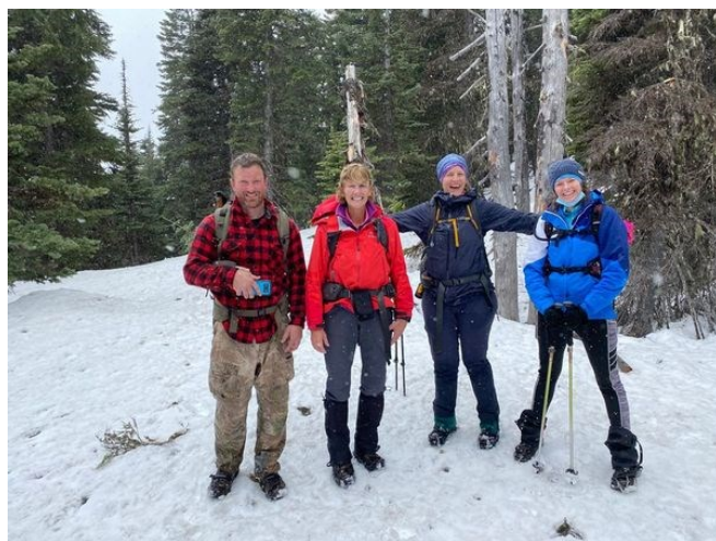
Gumjuwac-Badger Lake Hike.