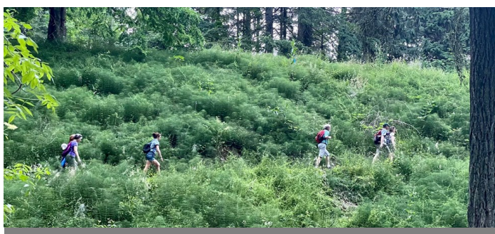
Annual Solstice Triple Crown.

Contact: see Meetup for full details, fees and to register