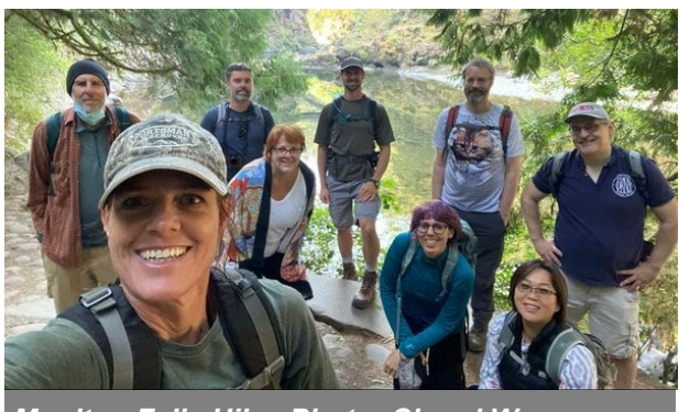
Moulton Falls Hike.