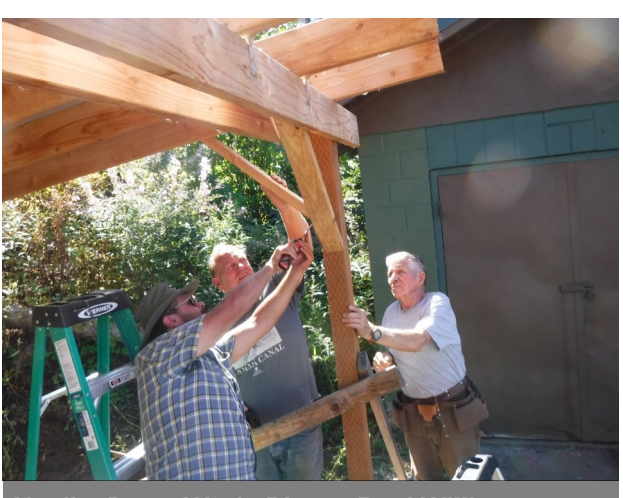
Nesika Dorm Work.