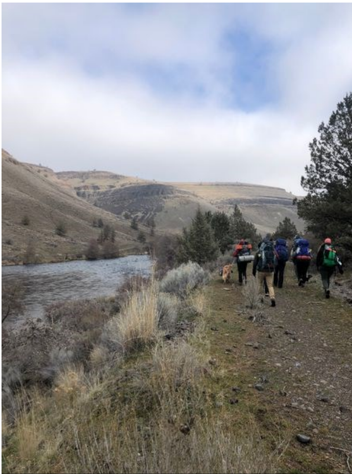
Trout Creek Backpack.

Trip is dependent on snow level. We'll clear 5+ miles of road and Monster Trail into Nesika Lodge. Lunch and Drinks provided. Signup: see Meetup