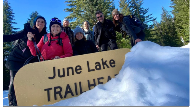
June Lake Snowshoe.

Scheduling, fees, and lodge availability are updated on website www.trailsclub.org