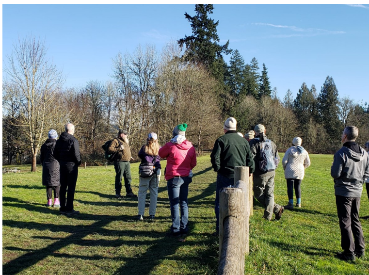
TCO Day at Champoeg State Park.