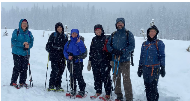
Tyee Snowshoe.