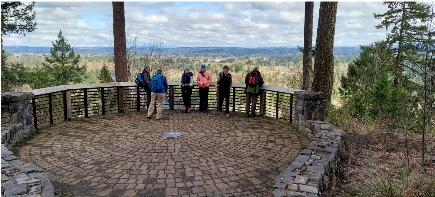
Milo McIver State Park Hike.