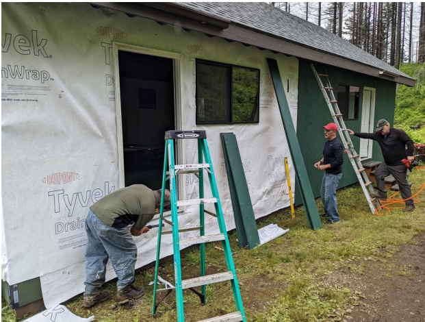
Working on Nesika Dorm.