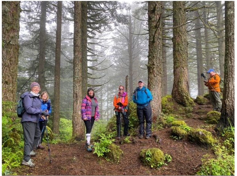
Nesika Membership Hike.