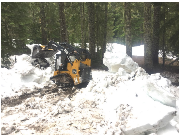
Bobcat Clearing Tyee Road.