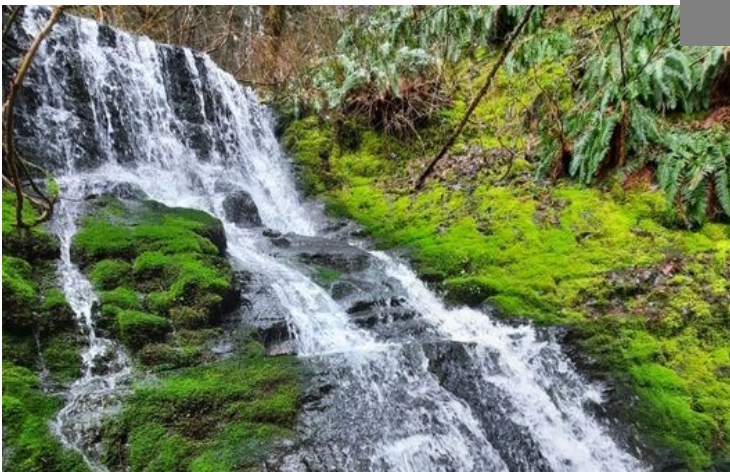
Gales Creek Story-Burn Hike.