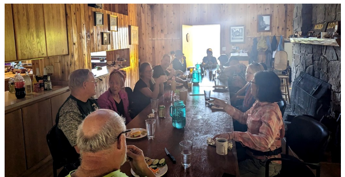
Nesika Work Weekend.