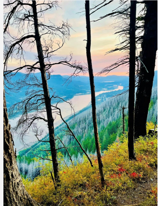
Waespe Point.

Beginning Balance, Aug: $5,648 Checks and Payments: $13,365 Deposits and Credits: $2,072 Cleared Balance: $6,356