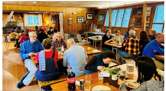
Tyee Open House.