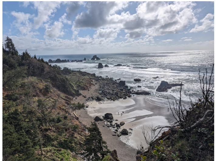
Ecola State Park.

For activities such as bicycle, snowshoe, and XC skiing check with the leaders for the difficulty level. Good equipment for the specific activity is required for all events. For hikes, snowshoes: