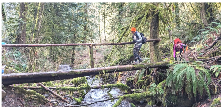
Archer Mountain Hike.