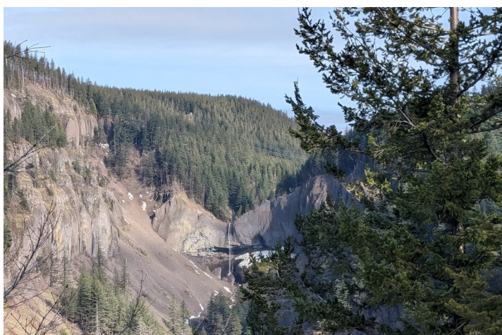
Archer Mountain Hike.