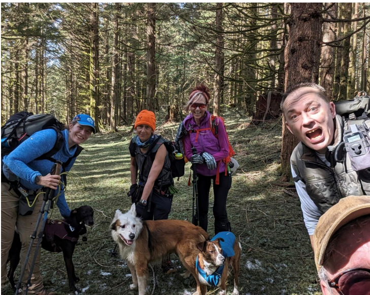
Archer Mountain Hike.