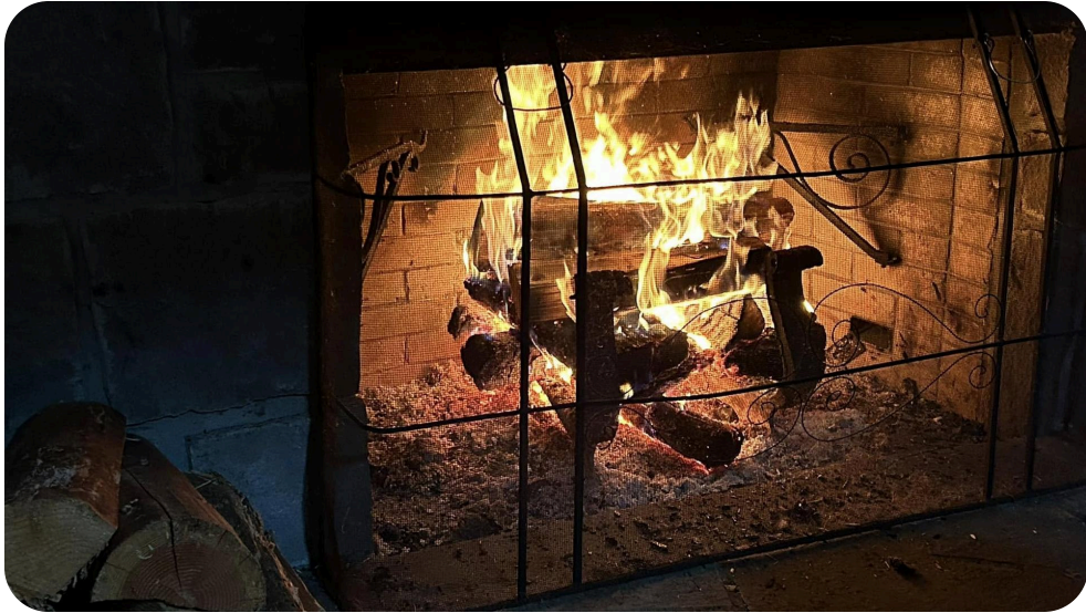
Nesika fireplace

Streaming on PBS Passport and other services listed at https://www.elementalfilm.com/