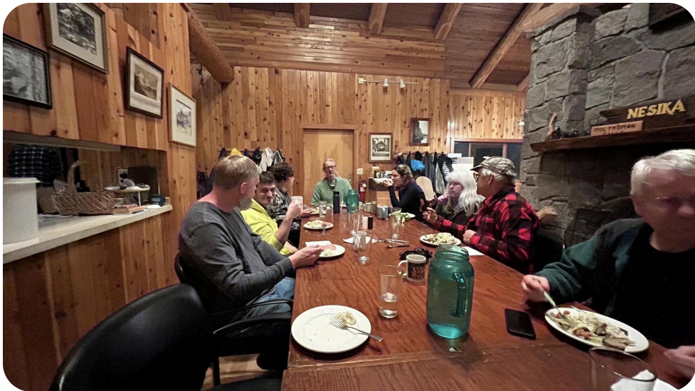
Nesika New Years