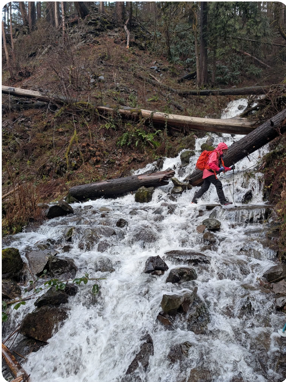
Winter Creek