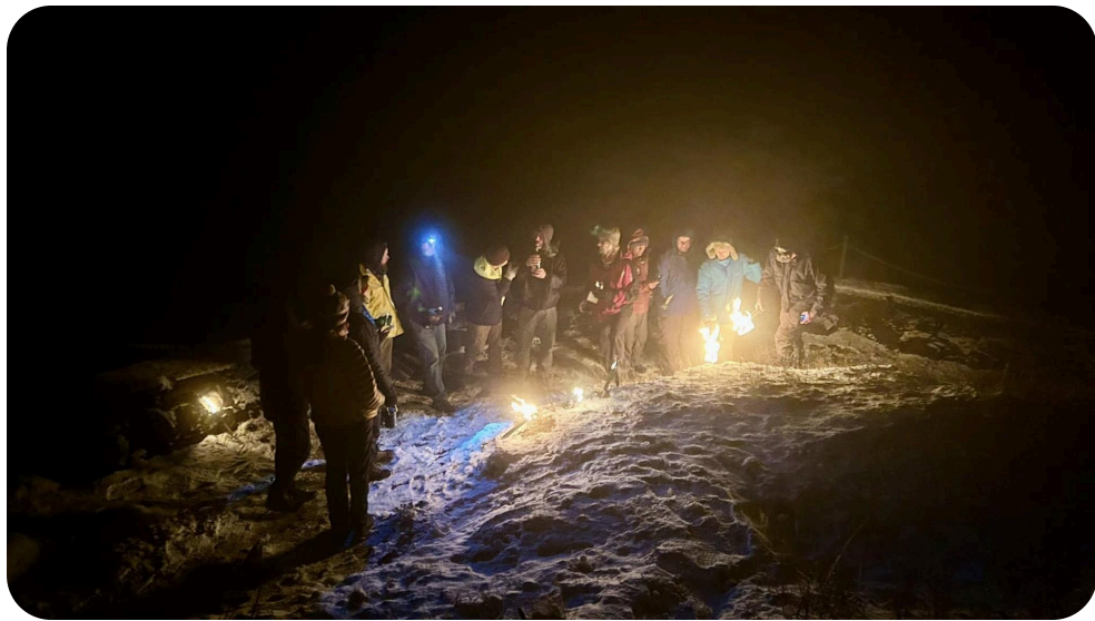
Bickel point flares