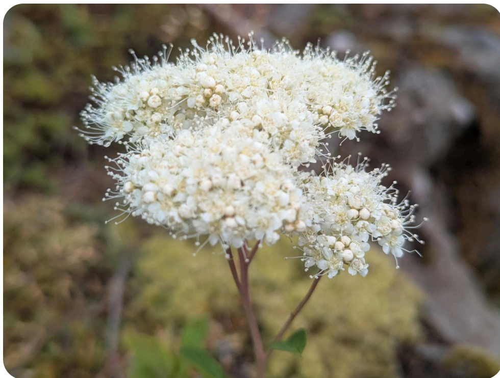
Shinyleaf Meadowsweet on Elevator Shaft