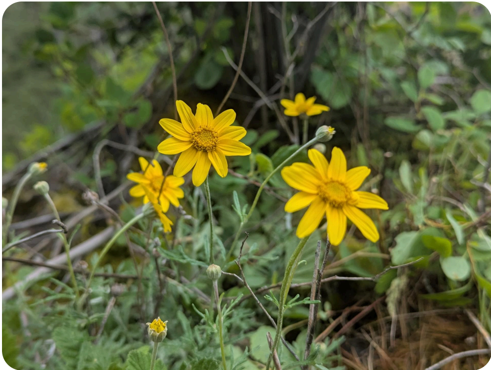
Common Woolly Sunflower on Elevator Shaft