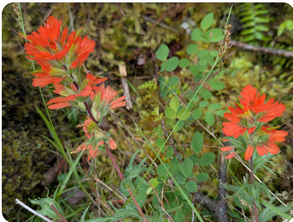
Harsh Indian Paintbrush on Elevator Shaft