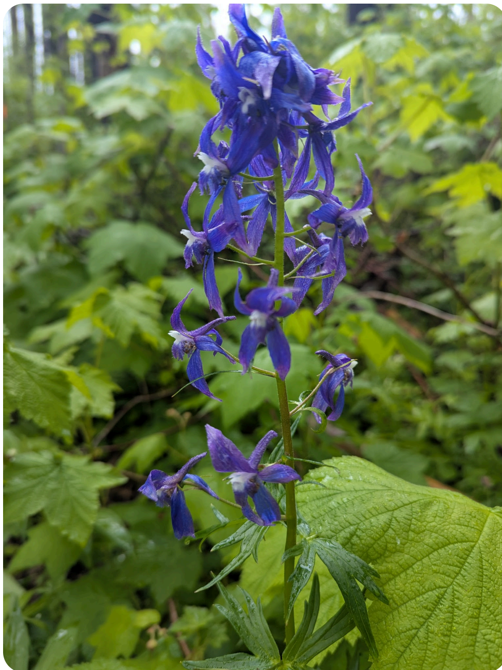
Columbian Larkspur on Elevator Shaft