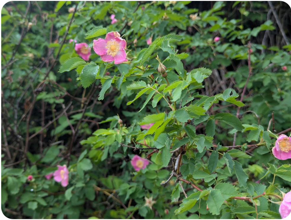
Baldhip Rose on Elevator Shaft