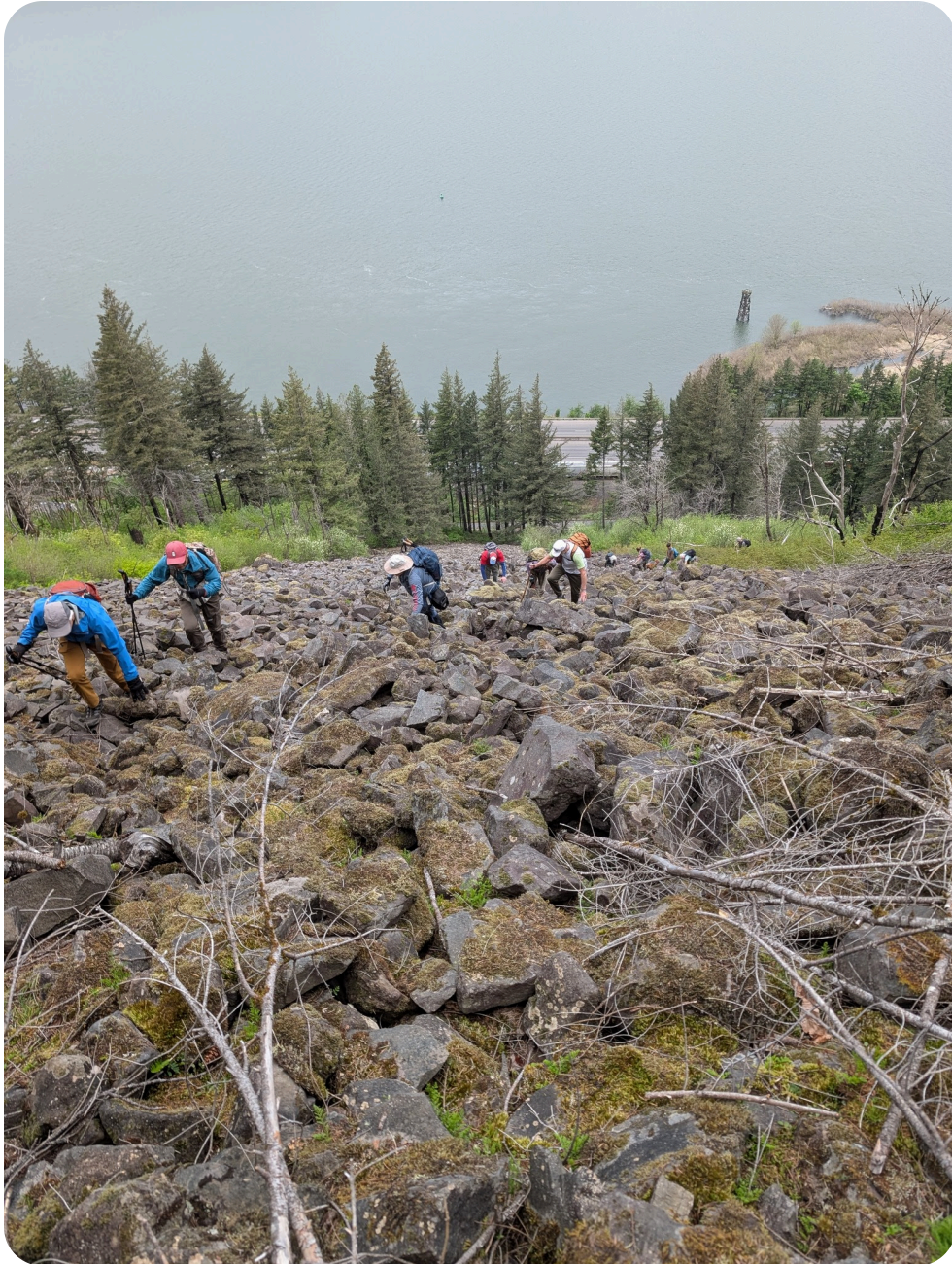
Elevator Shaft looking down