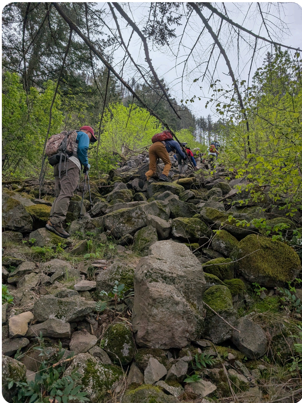
Elevator Shaft looking up