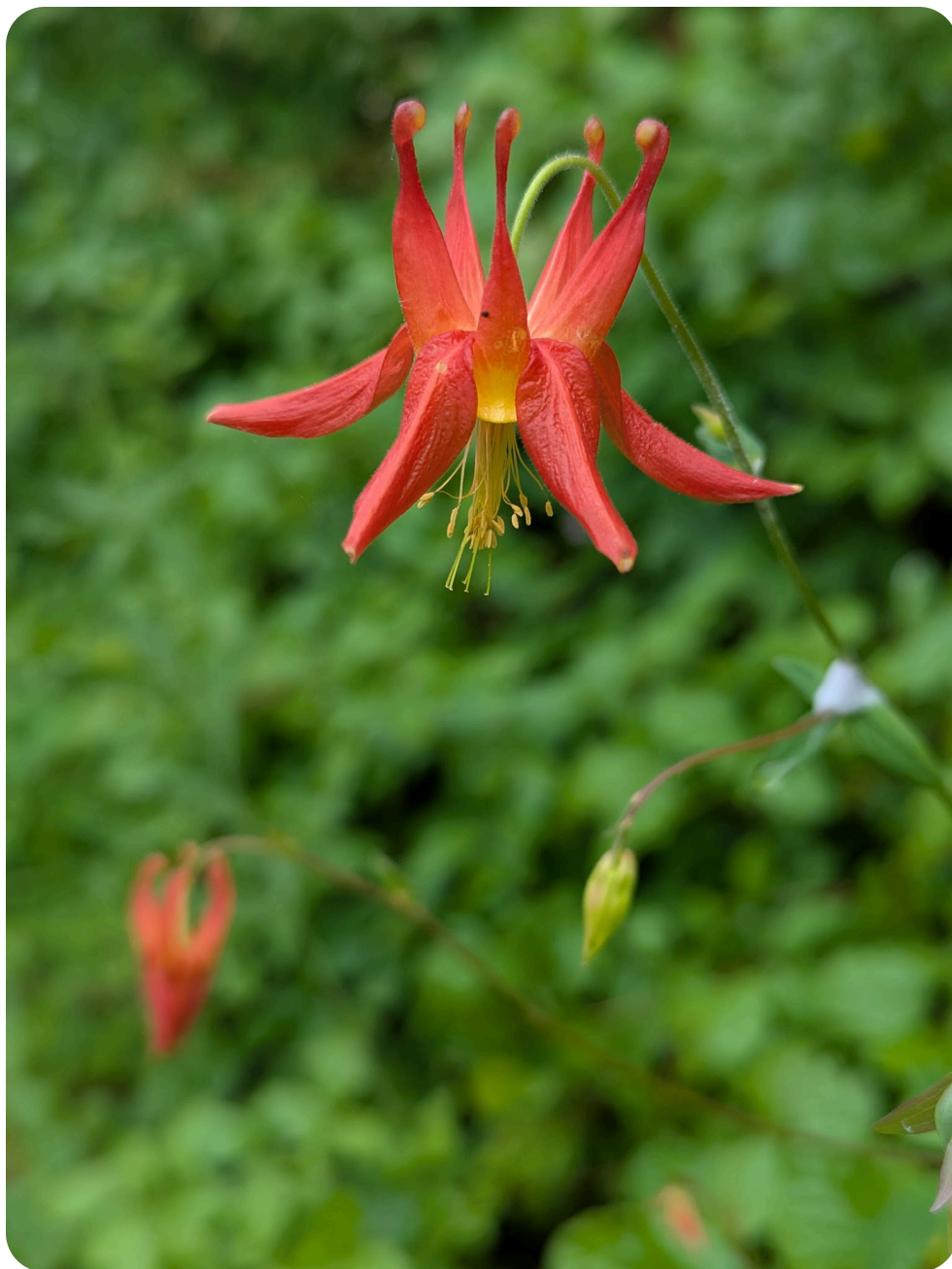
Western Columbine on Elevator Shaft