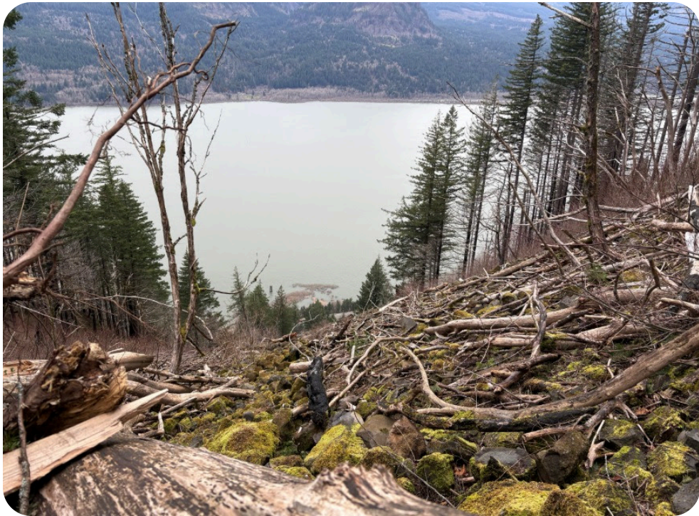
Elevator Shaft