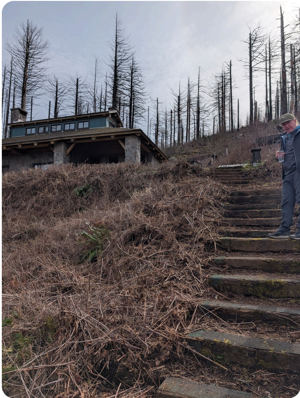
Cleared stairs at Nesika