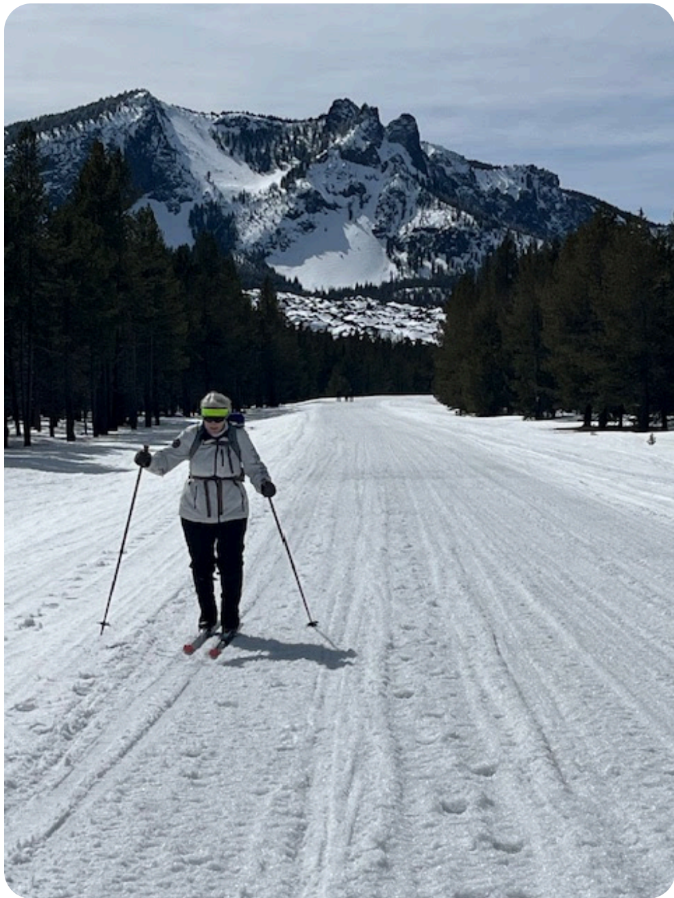
Newberry Ski Weekend