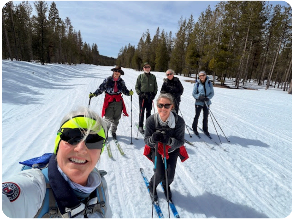
Newberry Ski Weekend