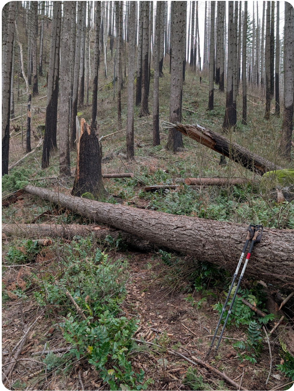
Elevator Shaft path on ridge