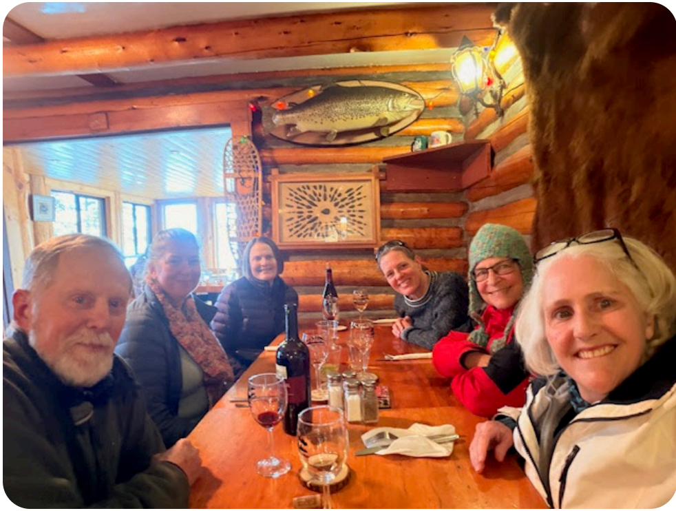
Newberry Ski Weekend