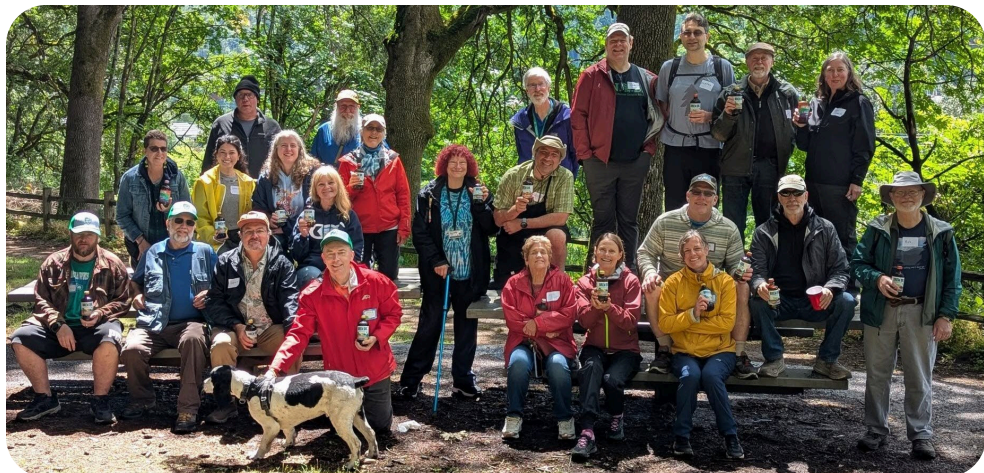
Social picnic