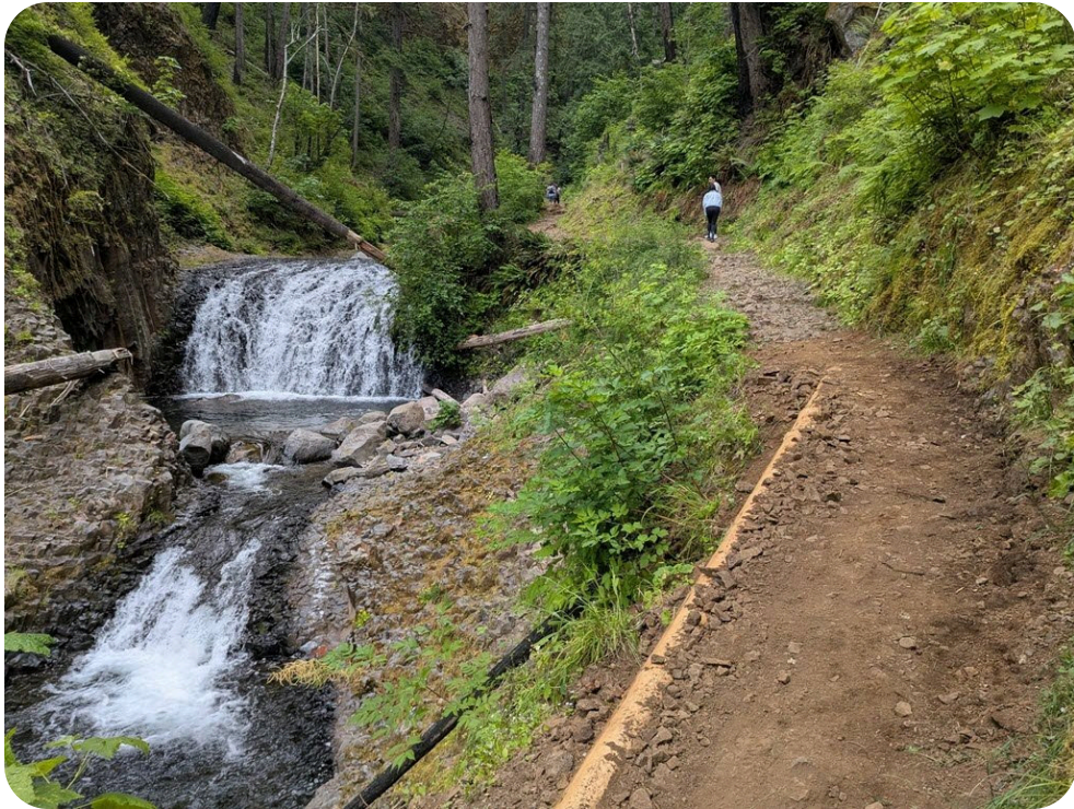
Multnomah Creek