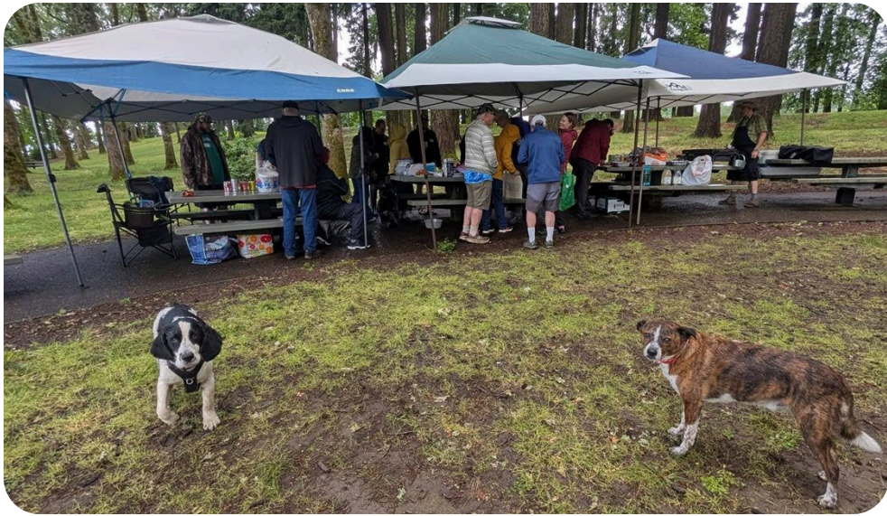
Social picnic