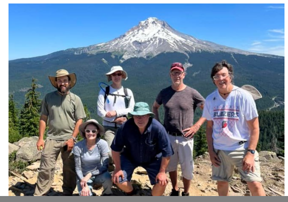
Mirror Lake Hike.

Save the Date: Annual Meeting Saturday, November 13, 2:00-4:00