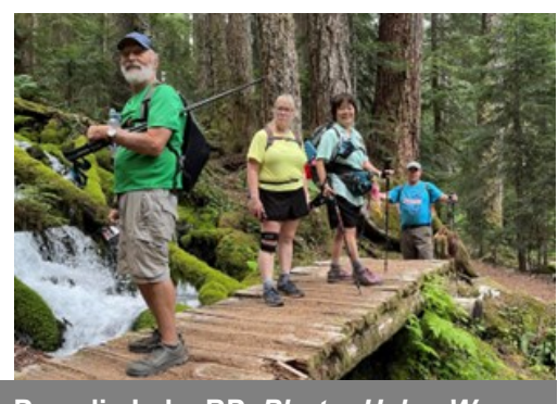
Pamelia Lake BP.