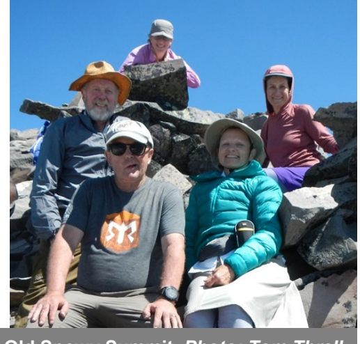
Old Snowy Summit.