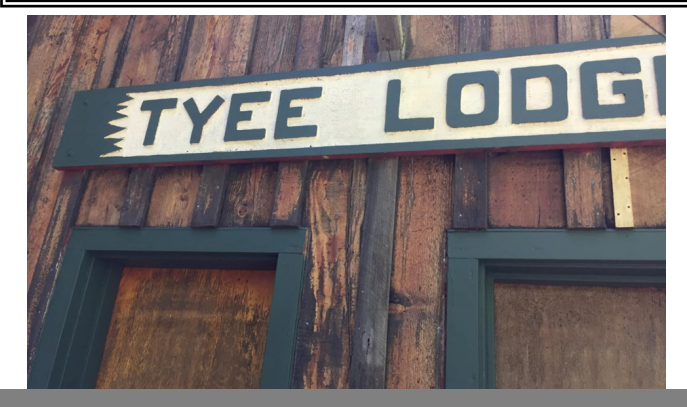
New Green at Tyee.

Send award nominations to: socialchair@trailsclub.org