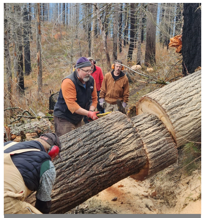
Nesika Road Clearing.