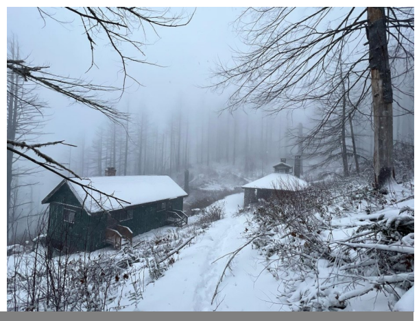
Snowy Nesika.