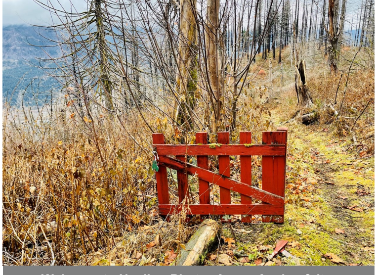
Welcome to Nesika.