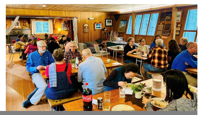
Tyee Open House.