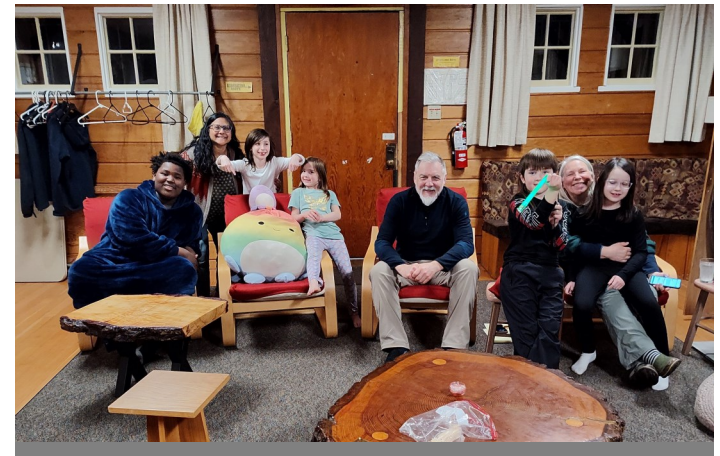
Kids Stay Free at Tyee.