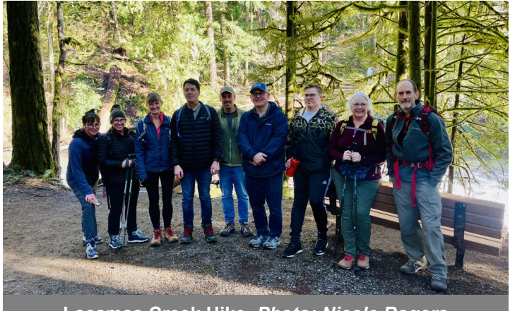
Lacamas Creek Hike.