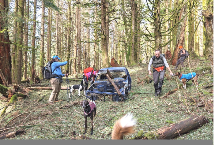
Secret Hike.

Stay with the group and follow the leader. The leader is responsible for the group's safety. The leader determines which route is taken. The leader has authority to determine if a participant is prepared for the activity. Group safety must come first.