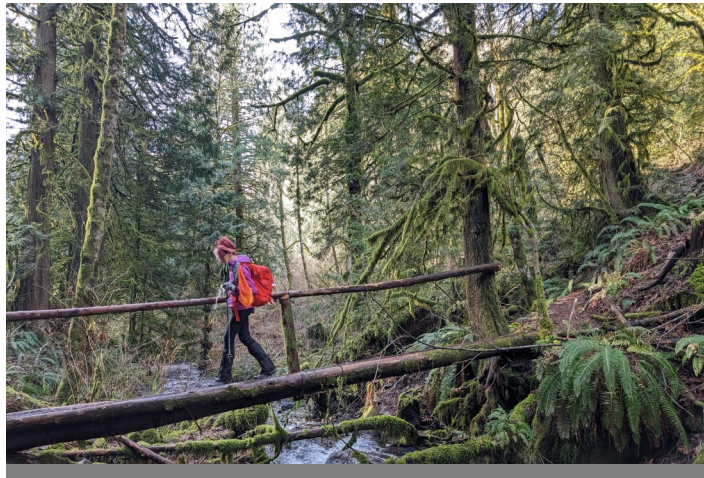
Larch Mountain Hike.