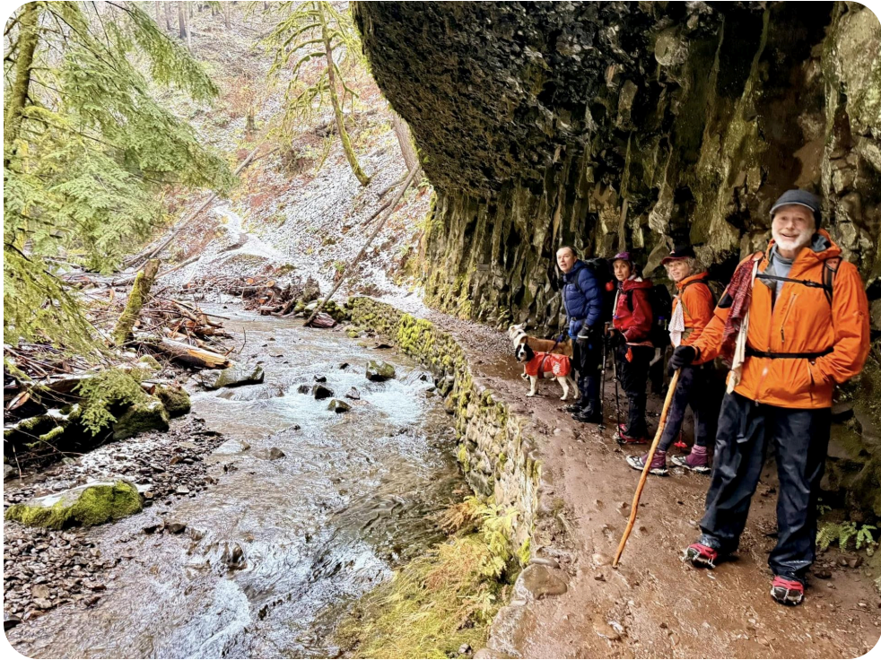
Multnomah Creek