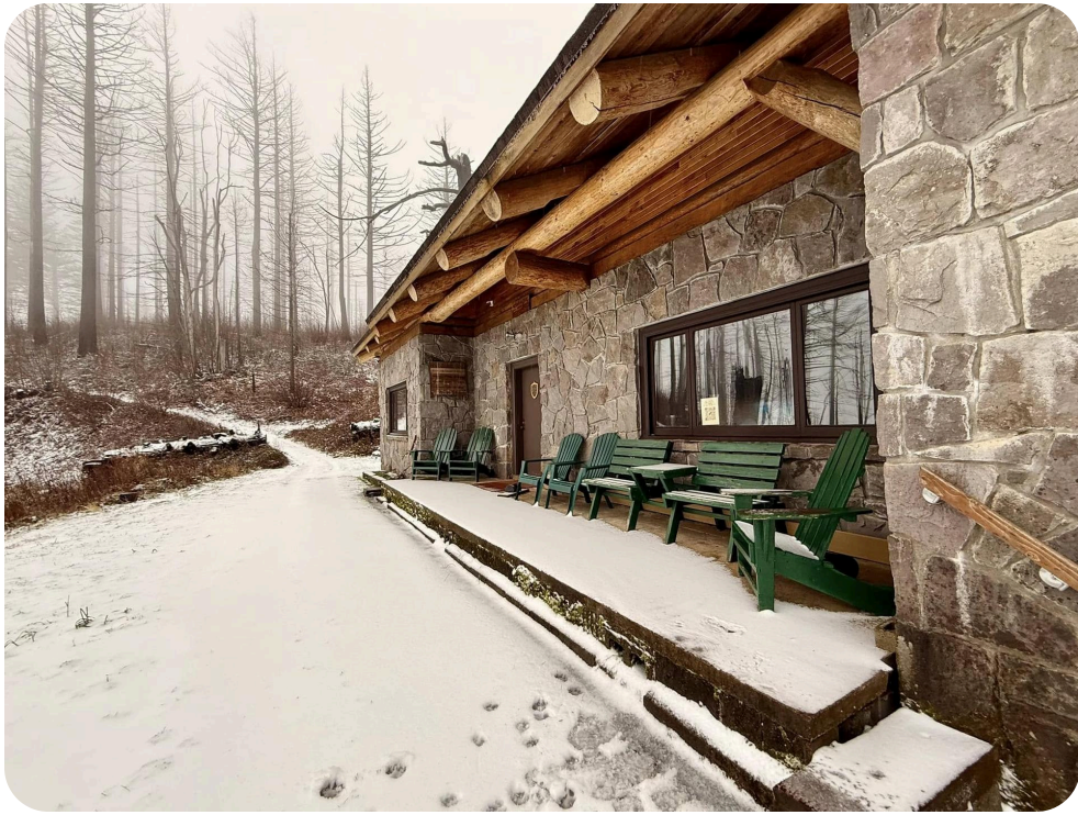
Nesika in snow