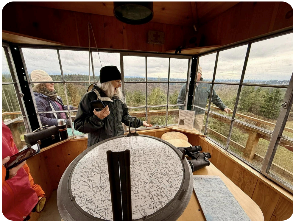
Hopkins lookout