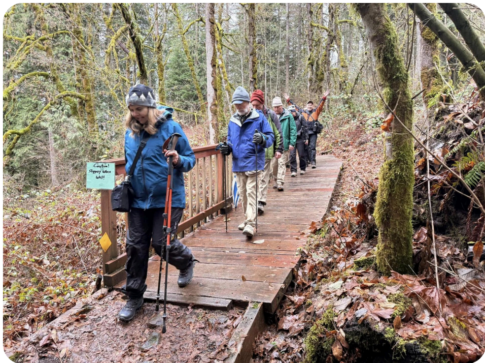
Hopkins hike