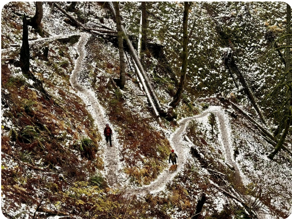
Larch Mountain Trail Switchbacks