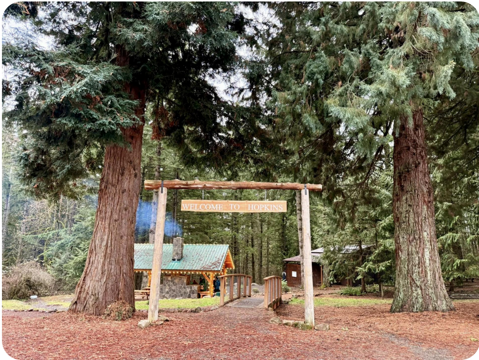
Hopkins Demonstration Forest