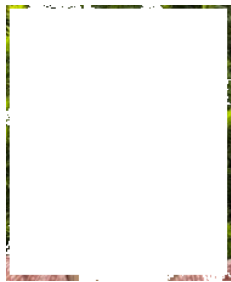
Outdoor Education and Outreach VACANT